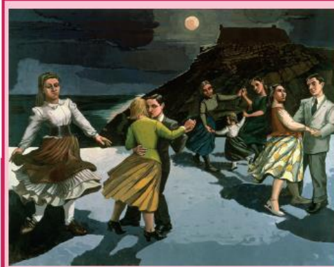
David Hockney A British painter, printmaker and photographer. One of the most influential British artists of the 20th century and contributor to the pop art movement of the 1960s. Homage to David Hockney No. 1, 2008, Holly Freen In © Copyright administrator: Bridgeman Images

Artwork © Fiona Rae, Untitled (orange, green and black), 1991 © Fiona Rae. All Rights Reserved, DACS/Artimage 2020. Photo: Antony Makinson and Prudence Curnig Associates Ltd