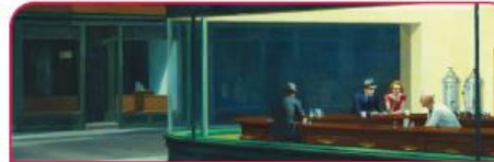
Edward Hopper An American realist painter and printmaker.