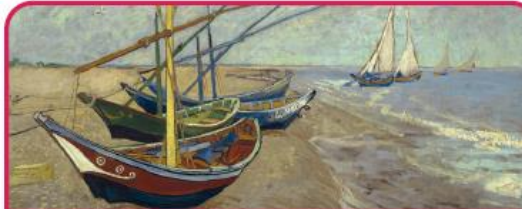
Vincent Van Gogh One of the most famous post-impressionist painters. He was from the Netherlands.