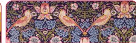
William Morris A British textile designer.