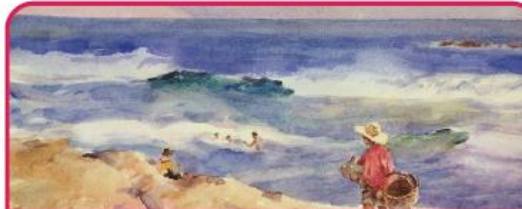
Joaquin Sorolla A painter from Spain, who painted portraits and landscapes.