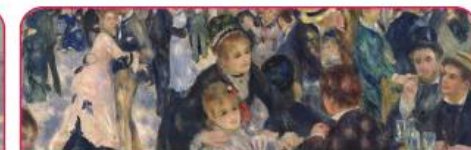
Auguste Renoir A French artist who lead in the development of the Impressionist style.