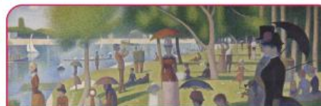
Georges-Pierre Seurat A French Post-impressionist artist.