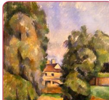
Paul Cezanne A French artist and Post-impressionist painter.

Title: Country House by the Water, c.1888