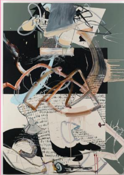
Fiona Rae A modern, British artist, born in Hong Kong.

Artwork © Fiona Rae, Untitled (orange, green and black), 1991 © Fiona Rae. All Rights Reserved, DACS/Artimage 2020.