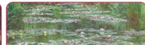
Claude Monet A French painter, and a founder of French Impressionist painting.