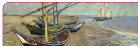
Vincent Van Gogh A Dutch painter and well-known Post-impressionist artist.