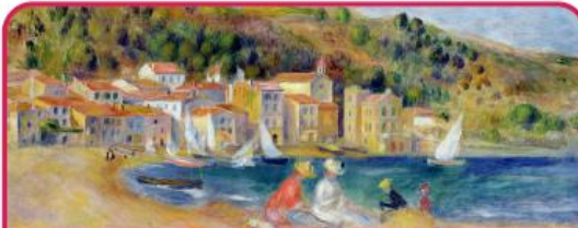
Auguste Renoir An artist from France who was a leading painter in the development of the Impressionist style.