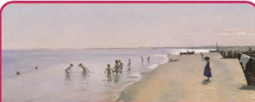
Peder Severin Kroyer A painter from Denmark.