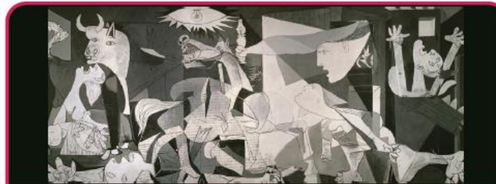
Pablo Picasso A Spanish artist who co-founded the Cubism art movement with artist Georges Braque in 1909.

Cubism ignores perspective and artists paint their subjects from lots of different angles.